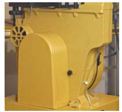
A huge iron casting provides a solid foundation that keeps the PWBS-14 rigid and vibration free.

The POWERMATIC PWBS-14 Bandsaw is built around a pair of huge iron castings that provide an extraordinarily rigid backbone. The lower box-shaped iron casting surrounds the drive wheel and provides a super rigid base on which the rest of the saw is built. The upper casting is equally oversized and designed with flex-fighting rounded corners and an upswept arm that effectively resists the pressures of tensioning <sup>3</sup>/<sub>4</sub>"-wide blades properly.